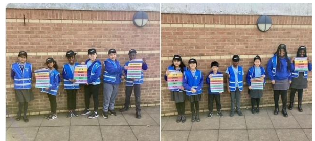
The St Catherine's Junior Joes.