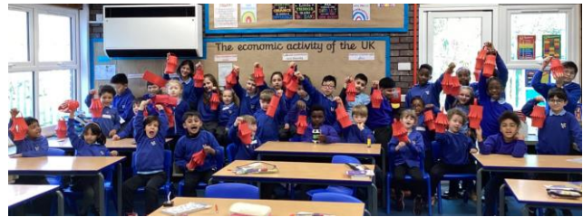
St Cuthbert's house group celebrating Chinese New Year

Our school has house groups, the House Groups are named after four Saints; St Bede, St Cuthbert, St Aiden and St Hild. Our House Groups can get very competitive at times - as you already know the children are very eager to win! We do many activities in our house groups such as celebrating Chinese new-year and National Storytelling Week. We do many more activities which you can see on our school Facebook page.