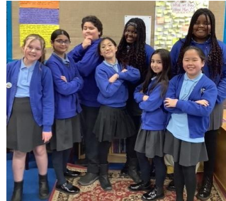
St Catherine's Chronical journalists

Some examples of the wonderful prayer the children of St Catherine's have led.